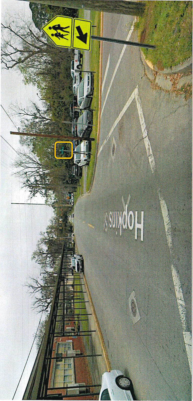
Street Sign Locations - Honorary Street Sign will be attached below the actual street name and Honorary Sign will be brown in color.