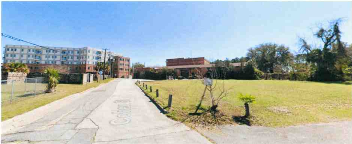
A view of Savannah Station and The Blake from the site proposed for development on Cohen St (right).

MPC Staff Comment: The proposed amendment is not a revision to bring a local ordinance into conformance with state or federal law.