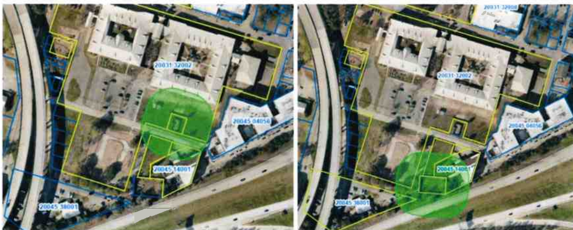
Green buffers represent 100’ boundary from Jewish cemeteries