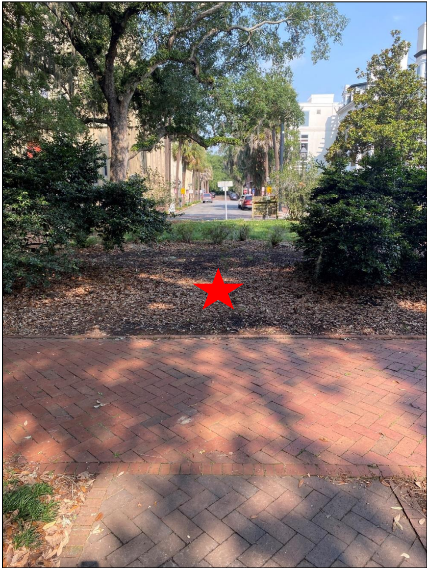
Location as seen from the walkways: