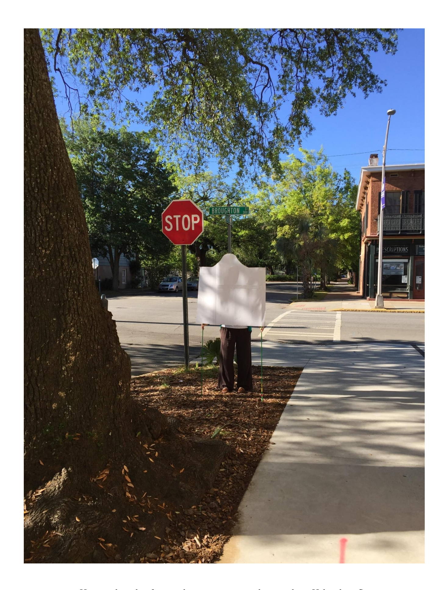
\label{thm:equation:equation:equation} Historical\ marker\ from\ pedestrian\ view-traveling\ south\ on\ Habersham\ St.