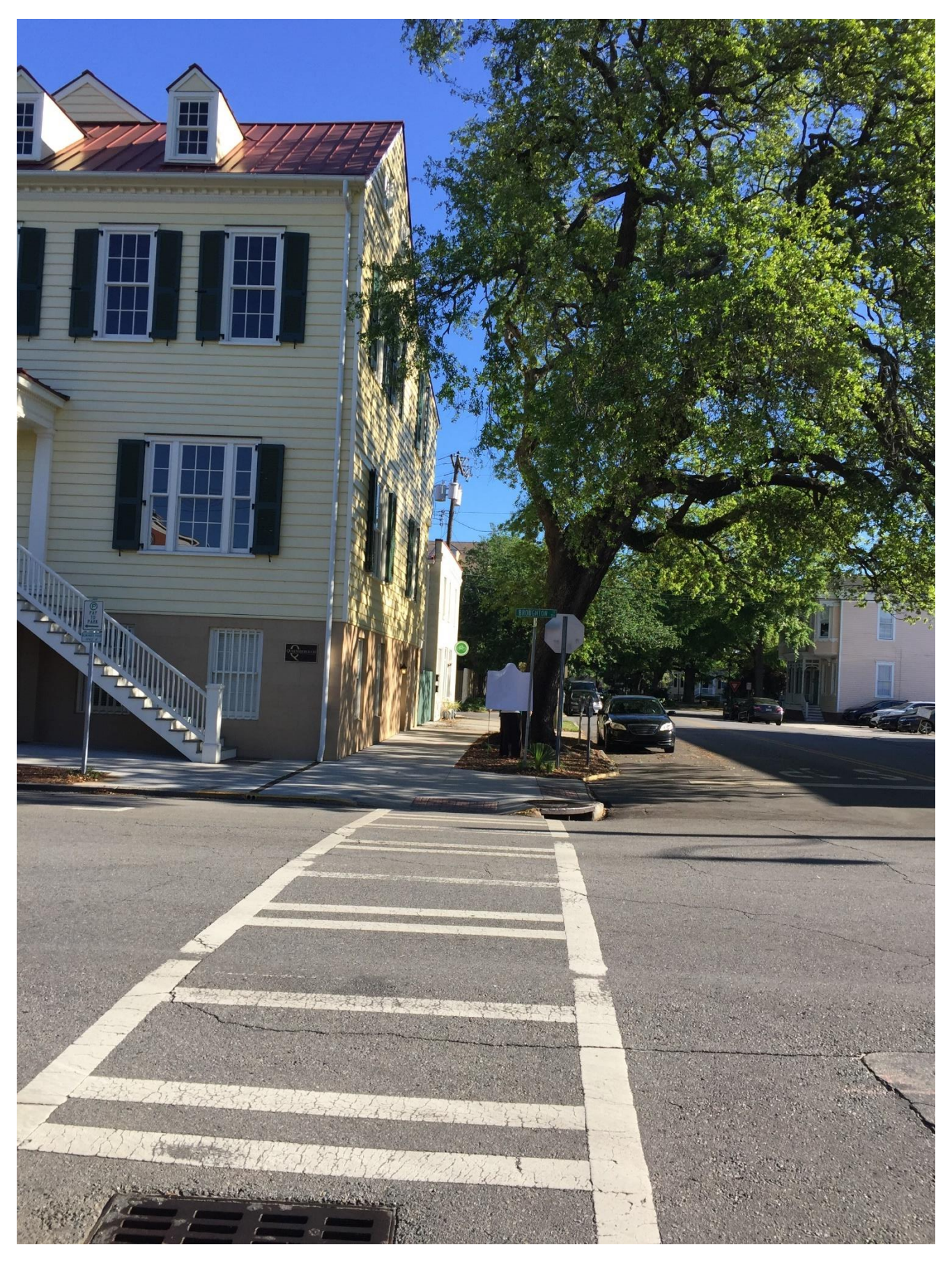
Historical \ marker \ from \ street \ view-traveling \ east \ on \ Broughton \ St.