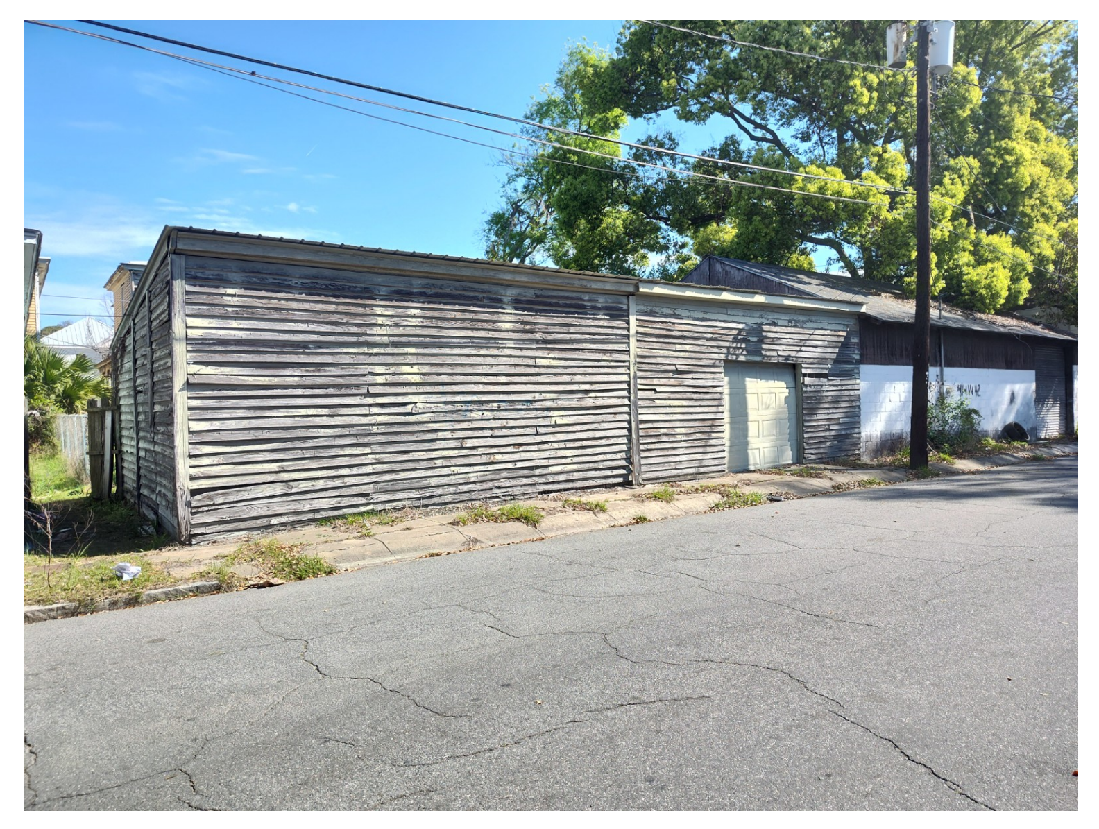
West 42<sup>nd</sup> Street subject property