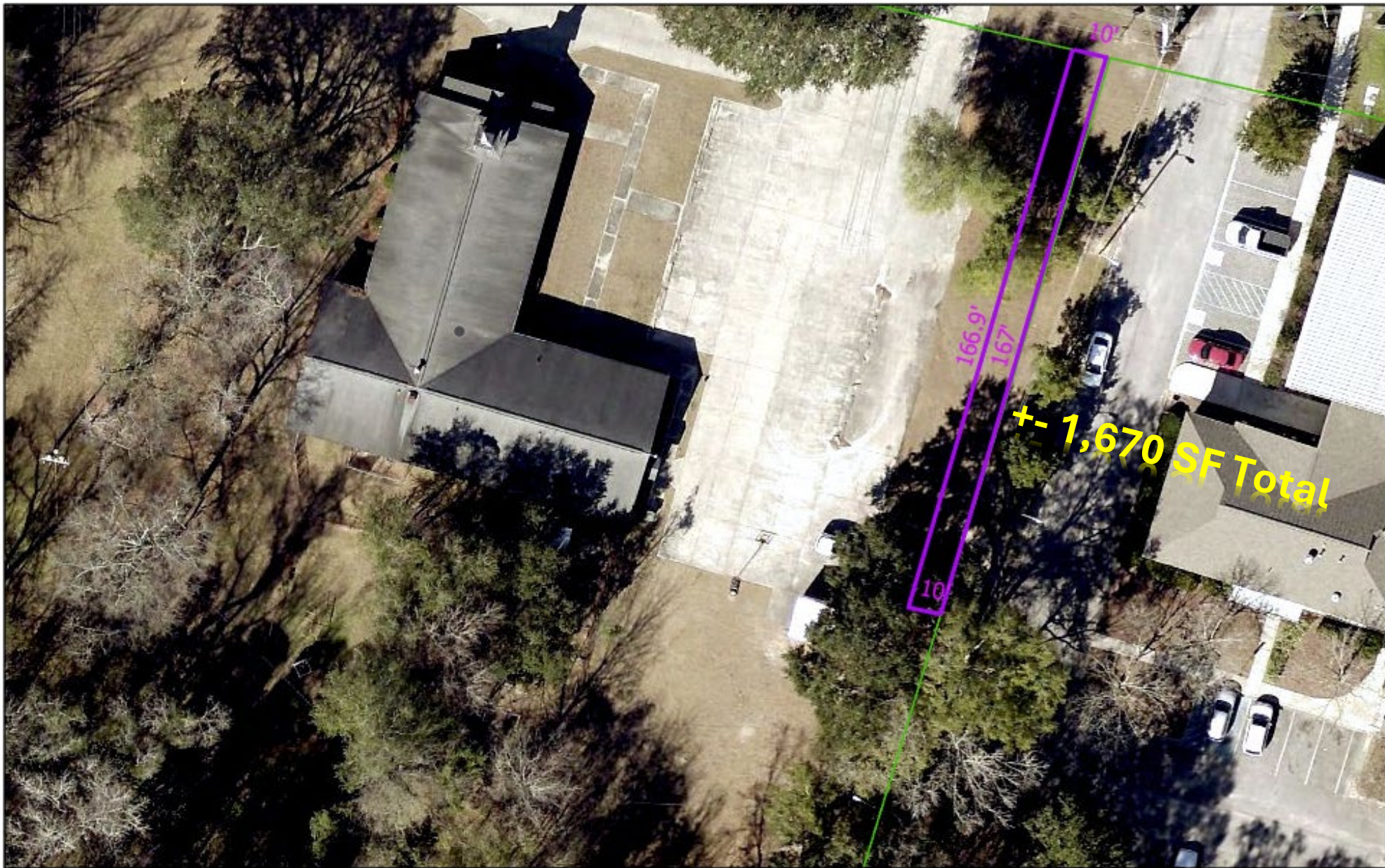
Exhibit Mills B Lane Parking Lot