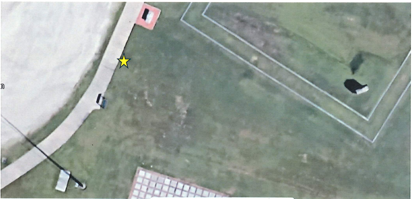
Arial view of Battlefield Memorial Park. Star marks proposed marker location.

The marker will be placed inside Tricentennial Park, western portion, along the sidewalk, between the SAR bench and an interpretive panel.