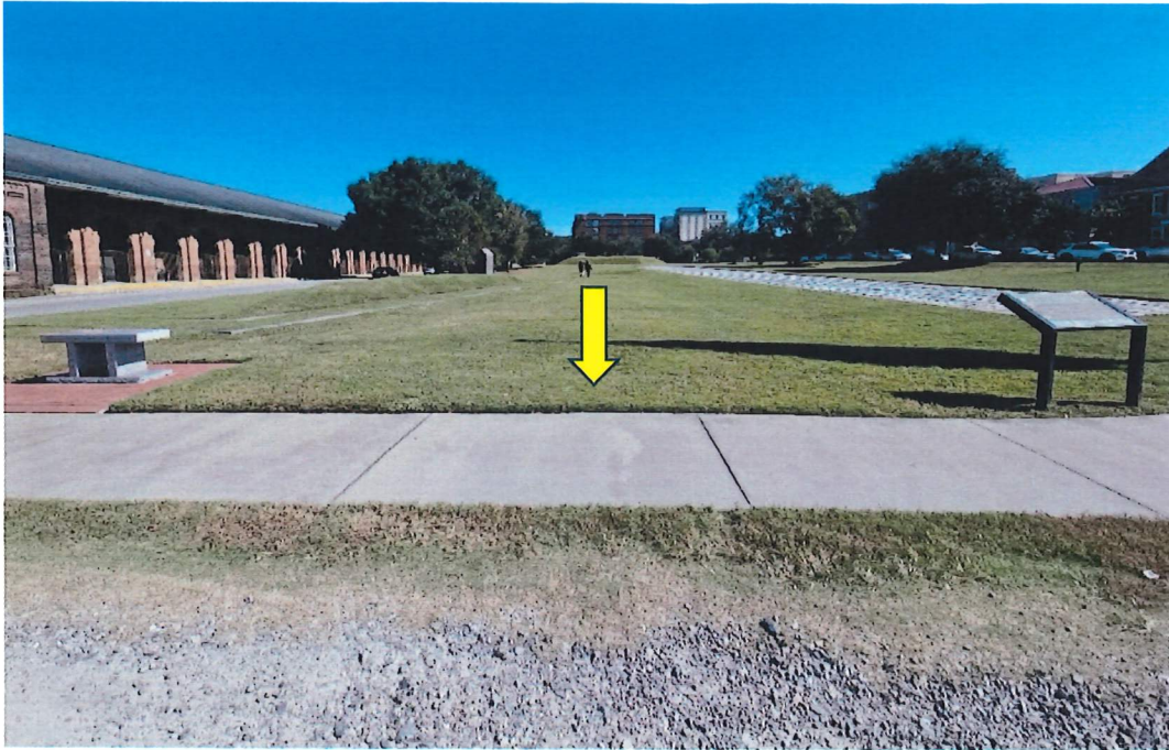
East-facing view of proposed marker location. Marker will be placed halfway between the SAR bench (left) and the interpretative panel (right), interior side of the field, 6 to 12 inches away from the sidewalk.