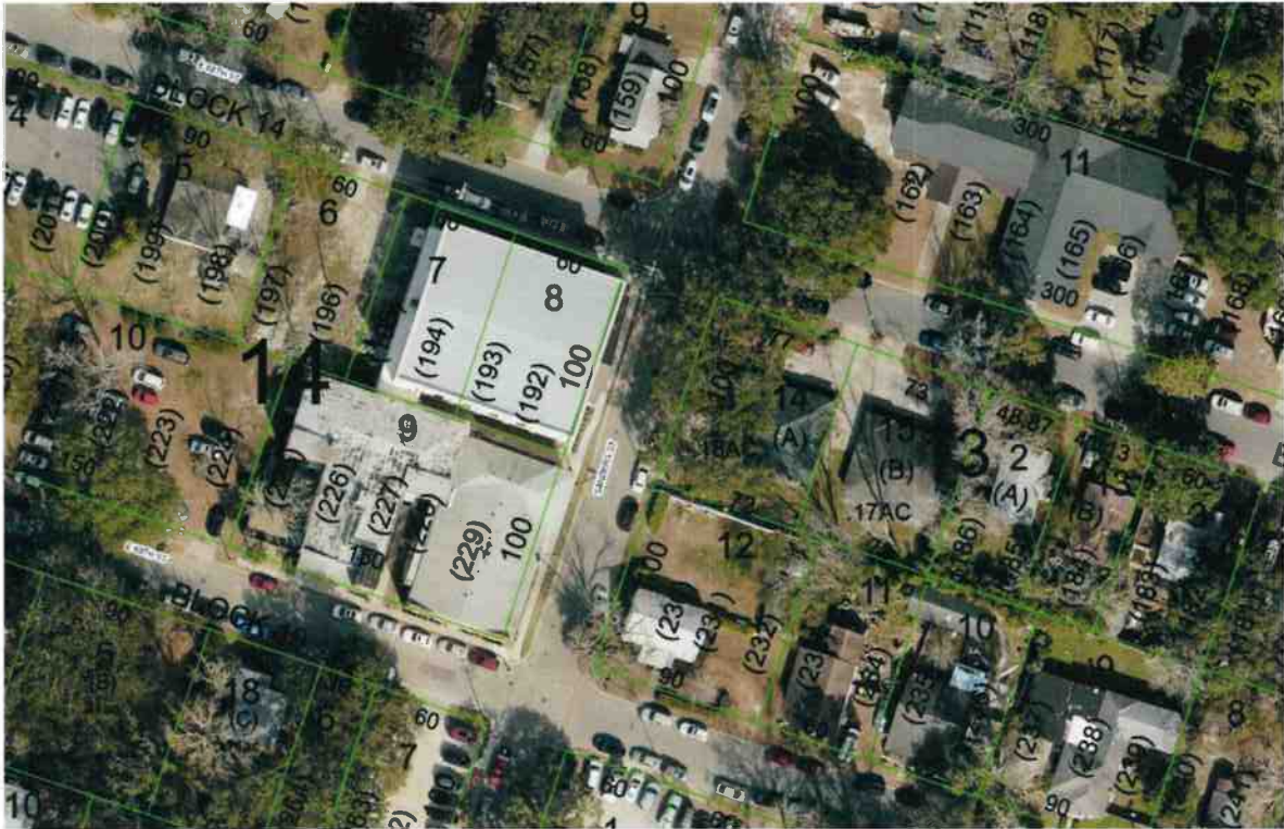
CBC Campus - 2017