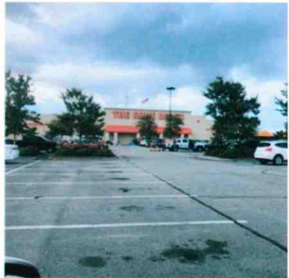
Figure 3: Prescribed Urban Transitional Character Area