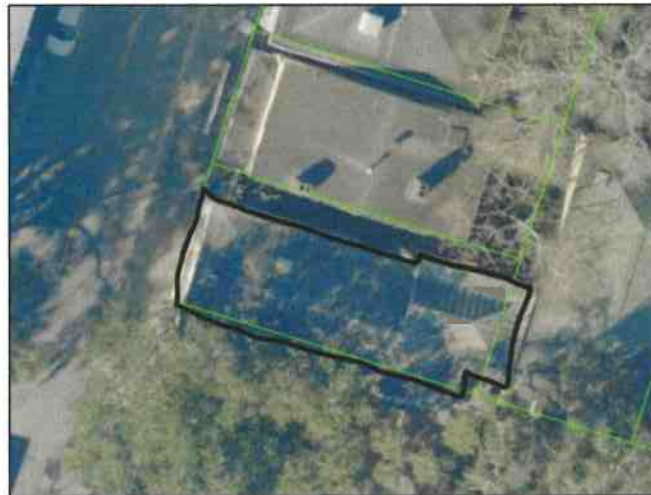
Current Building Footprint

The property owner has stated that when he purchased the property, it was a restaurant. There are historic images of the building including signage as “West Duffy Café” and at another time the building had signage as “Zenys Restaurant”. There is a projected sign for a hair salon currently on the building facing West Duffy Street. The past cafés served breakfast, lunch, and dinner. The establishment’s use as a restaurant was in business for over 30 years and closed in 1999. The property is currently being renovated and the