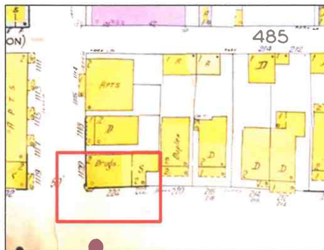
1953 Sanborn Map