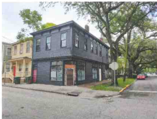
222 West Duffy Street – Front facade

REQUEST: The Petitioner is requesting approval of a Special Use pursuant to Section 3.10 of the Savannah Zoning Ordinance to establish accessory alcohol sales within a restaurant. The Special Use process includes review by the Planning Commission and the Savannah City Council. Should the use be approved by the Council, a permit will be granted by the City of Savannah which will be governed by the permit enforcement criteria outlined in Article 3 of the Savannah Zoning Ordinance.