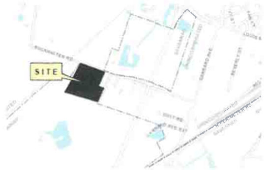
Figure 1 Location Map

Prepared by Melissa Leto, Senior Planner