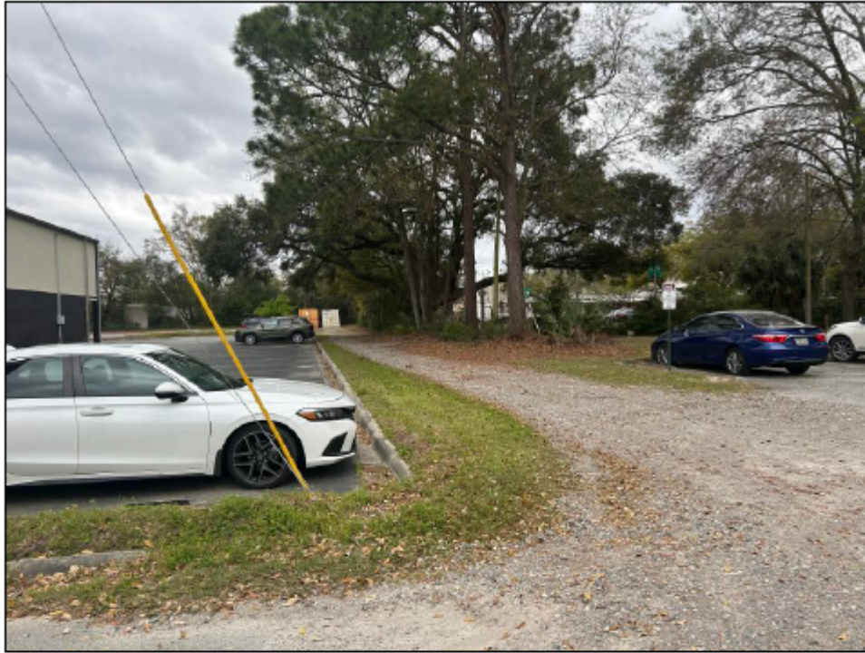
Southerly view of subject property from East 67 th Street