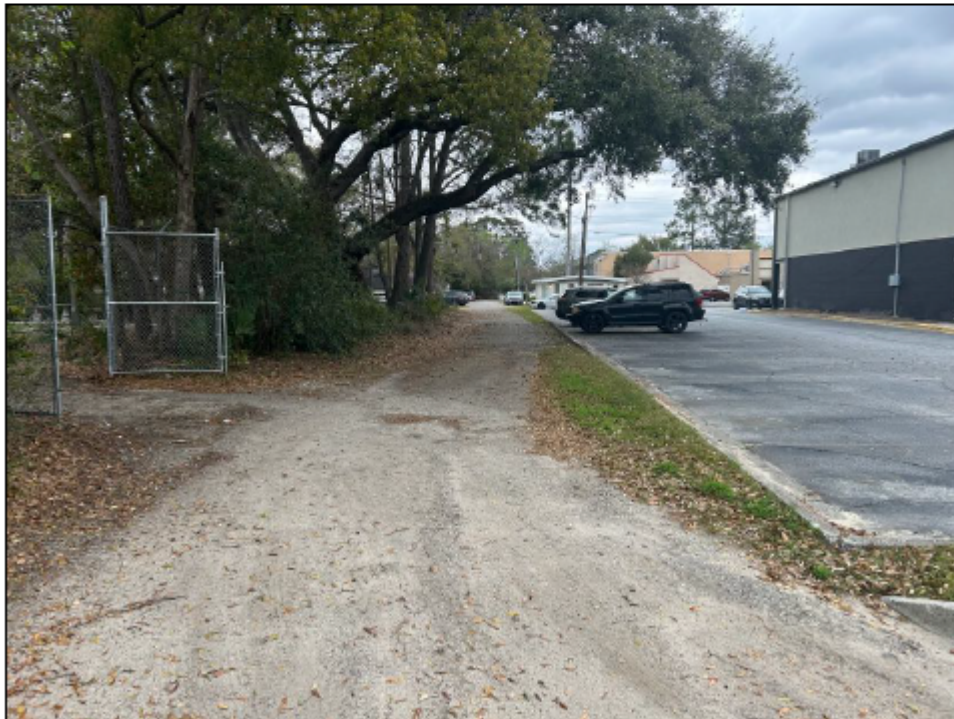
Northerly view of subject property from East 68 th Street