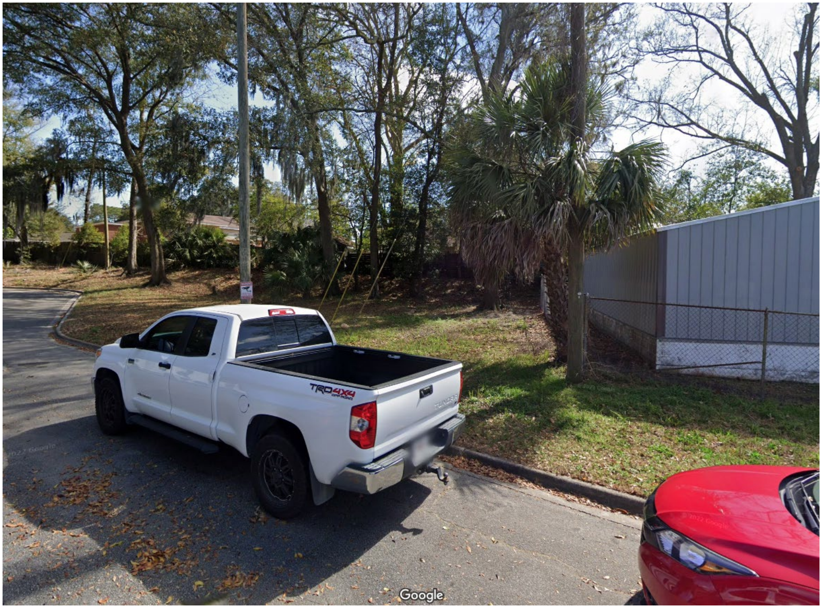
Aerial depiction of unopened right of way on Frost Drive