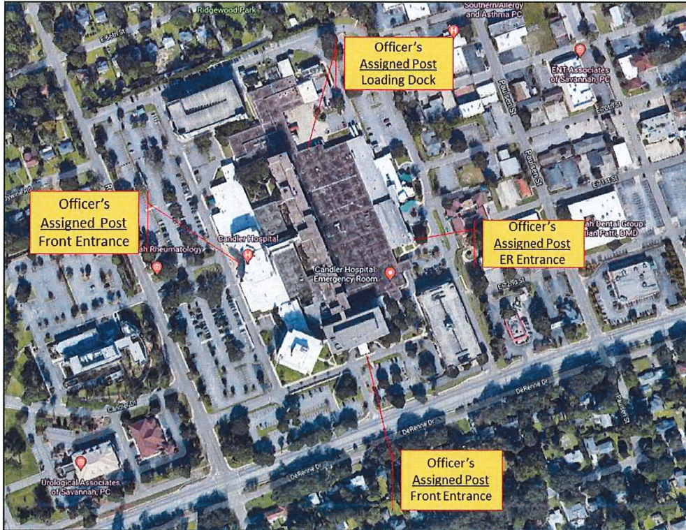
EXHIBIT "C-1" CANDLER HOSPITAL SPD POSTING ASSIGNMENTS