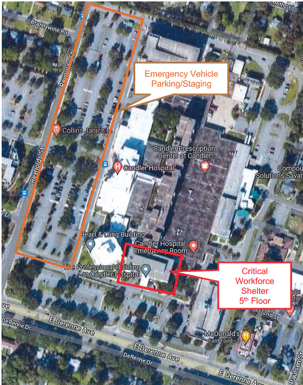
EXHIBIT "A" CANDLER HOSPITAL SHELTER AREA AND PARKING/STAGING AREA