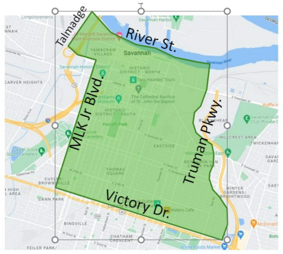
10 a.m. March 16 – 2 a.m. March 17