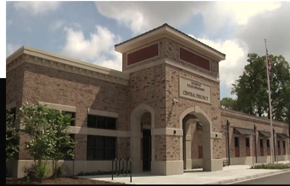
Public Safety Facilities & Apparatus