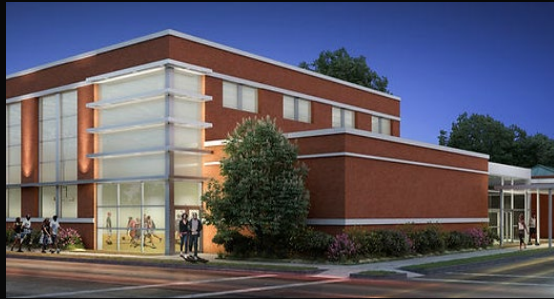
Parks & Recreation Facilities