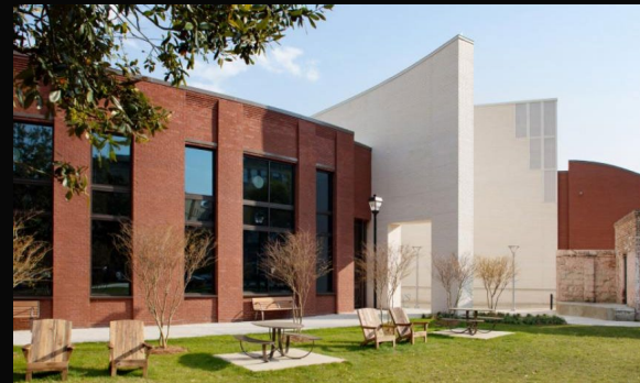
Cultural & Entertainment Venues