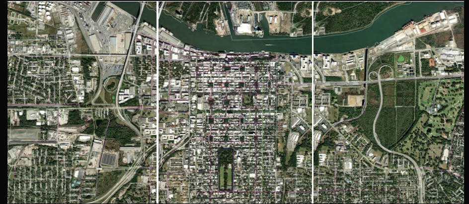
Transportation & Transit Infrastructure (Roads, Sidewalks, Bike Lanes & Trails)