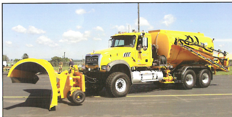
Truck Mounted De-icers