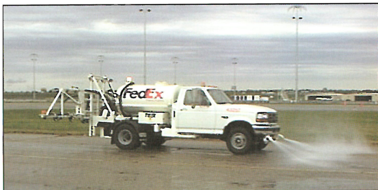
Ramp Unit De-icers

A world leader in high tech mobile spray application equipment