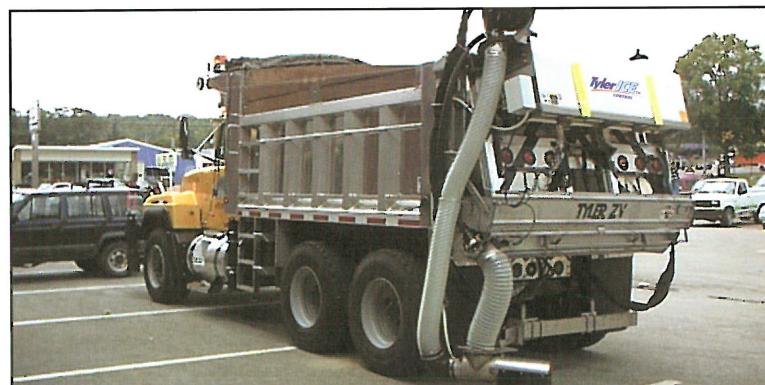
Zero Velocity Spreaders