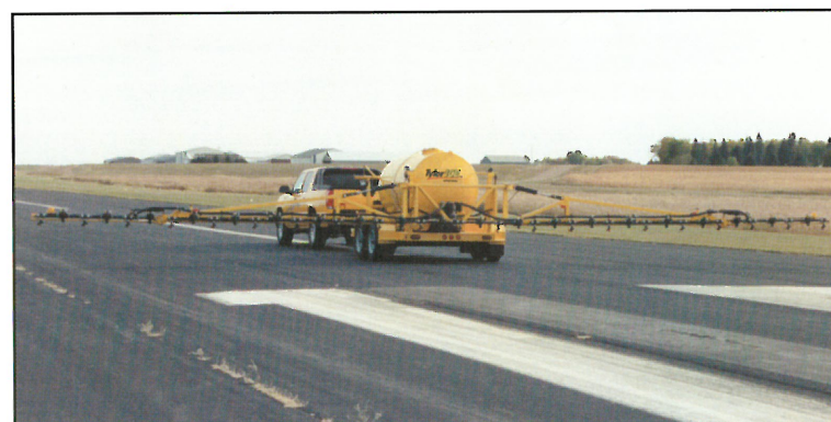
Trailer Mounted De-icers