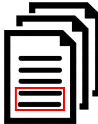
CH 7, F Quadricycles