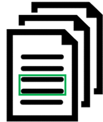
CH 6, DD Pedicab (Tours)