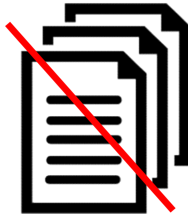
CH 6, S Carriages