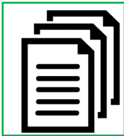
CH 6, R Tour Service

ADD REFERENCE TO NEW TOUR ORDINANCE ➡ Chapter 6, Article DD – Pedicabs