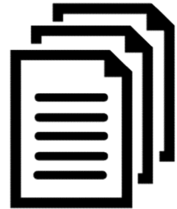
CH 6, DD Pedicab (Tours)