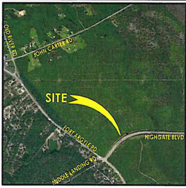
VICINITY MAP 1" = 3000'