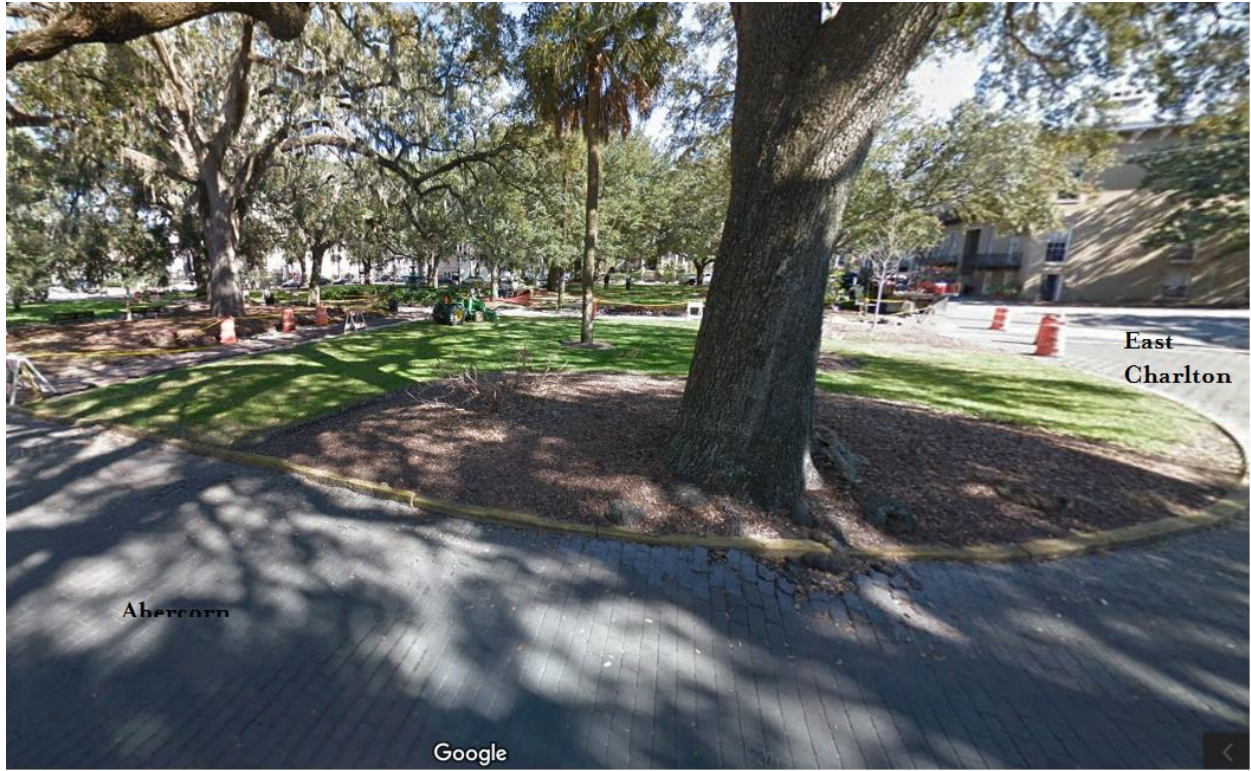
Southwest quadrant of Lafayette Square