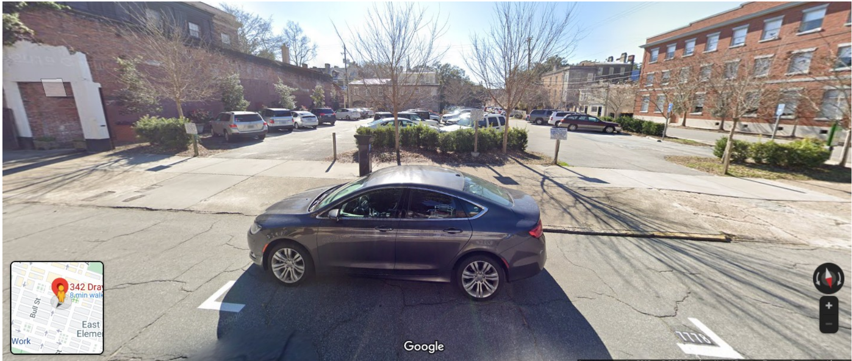
The historical marker is to be installed in the Charlton Street right-of-way.