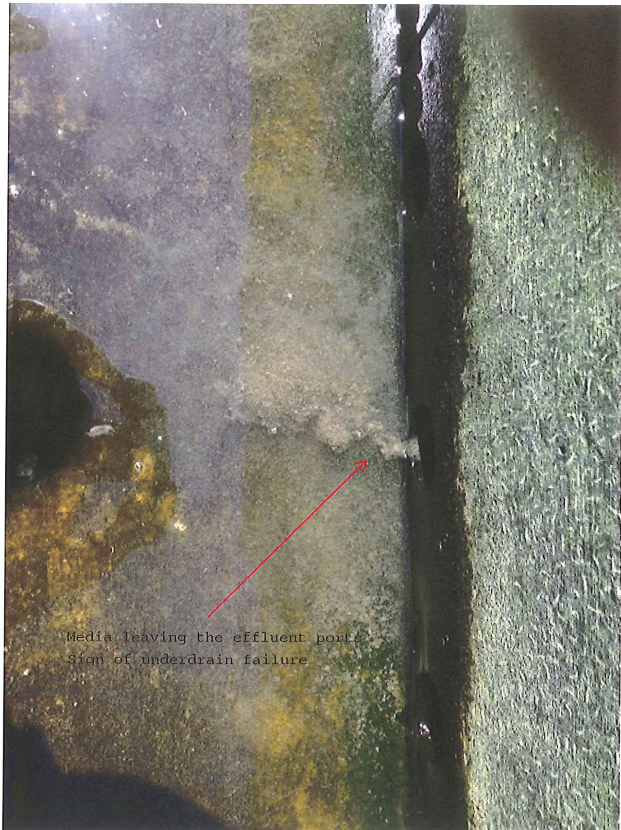
Media leaving the effluent ports Sign of underdrain failure