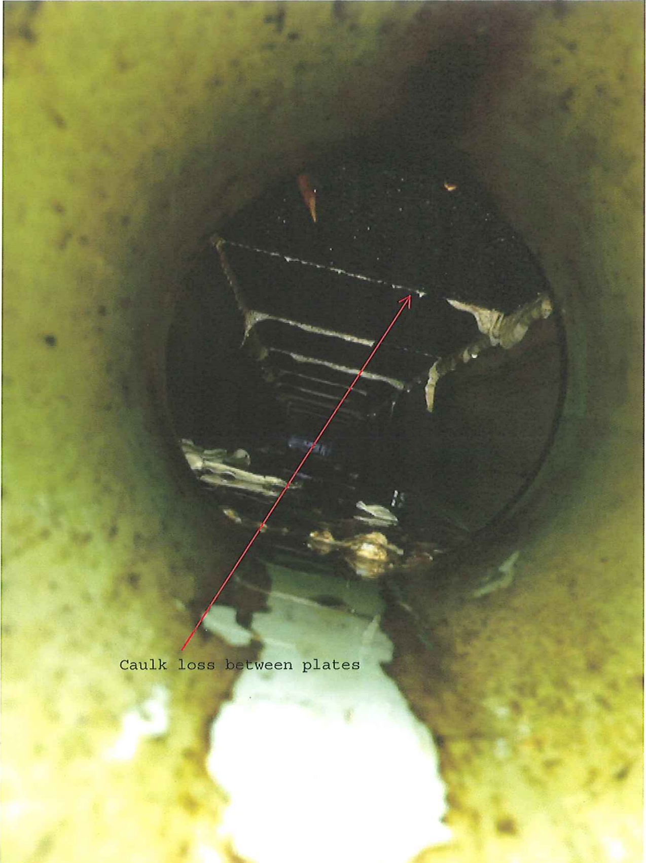
Caulk loss between plates