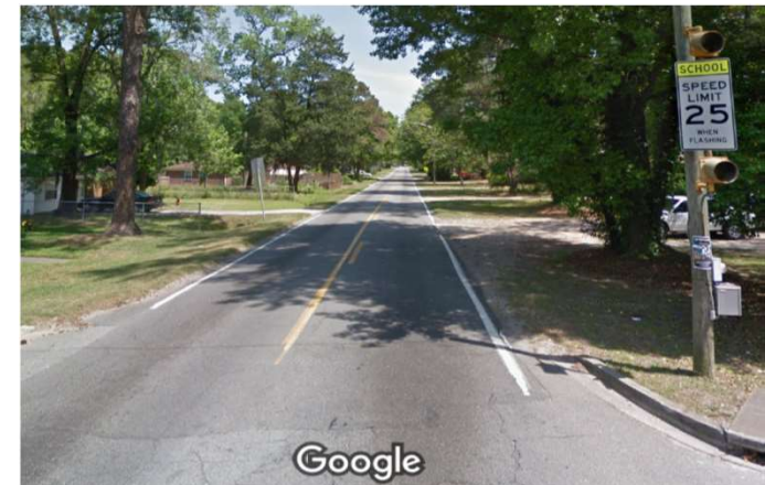
View East Along Delesseps at Costa Rica