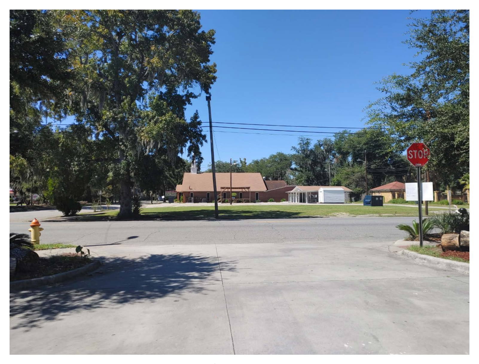
St. Luke Baptist Church across from subject property on Montgomery Street