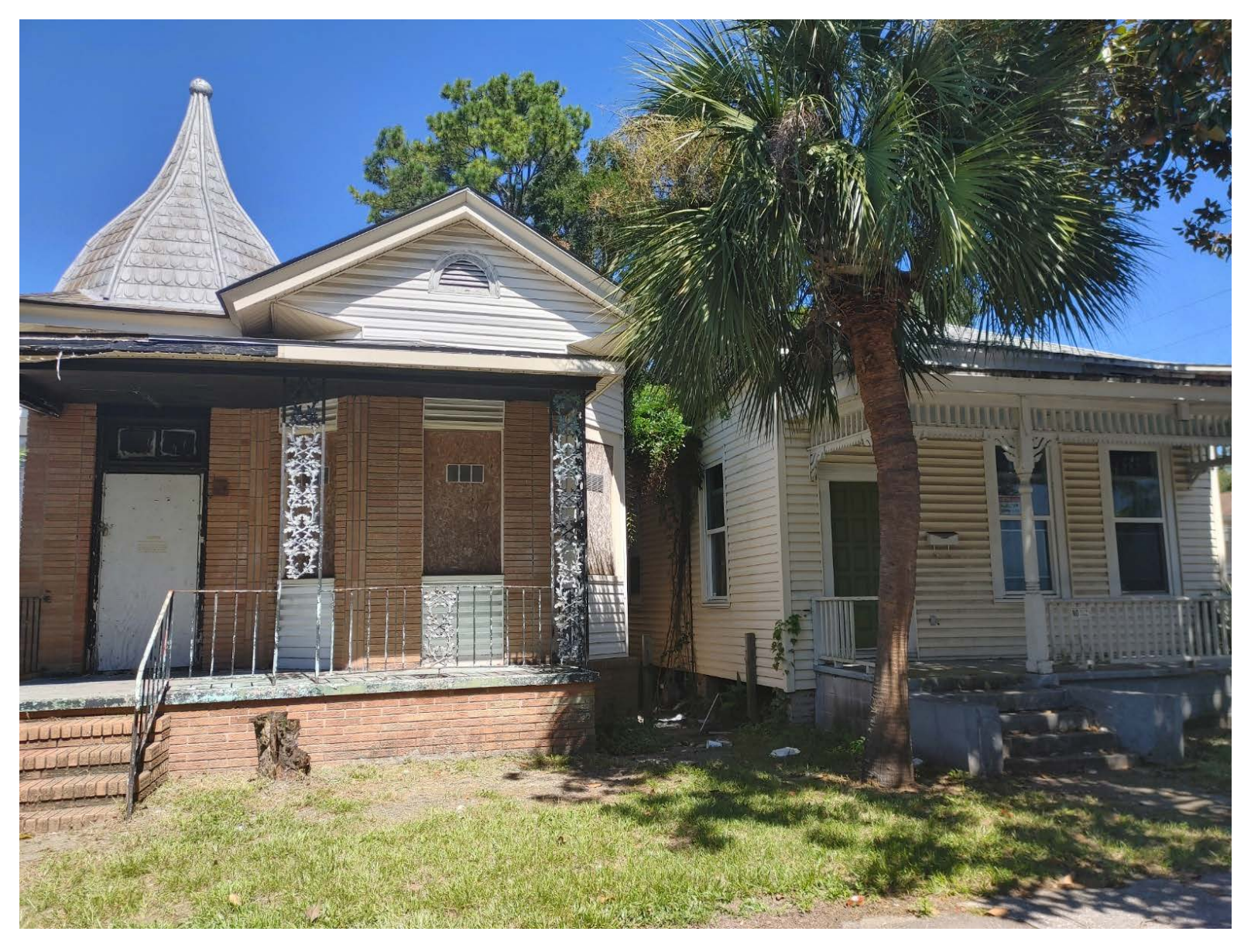
Residential structures adjacent to the subject property