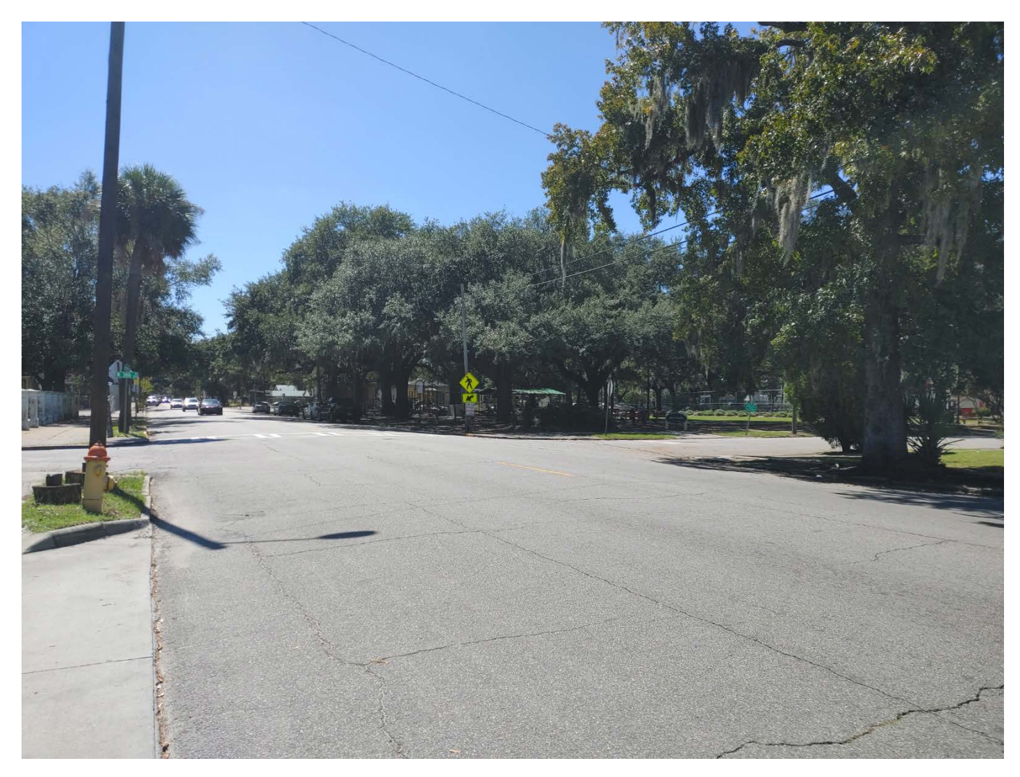
A city park is located diagonally from the subject parcel.