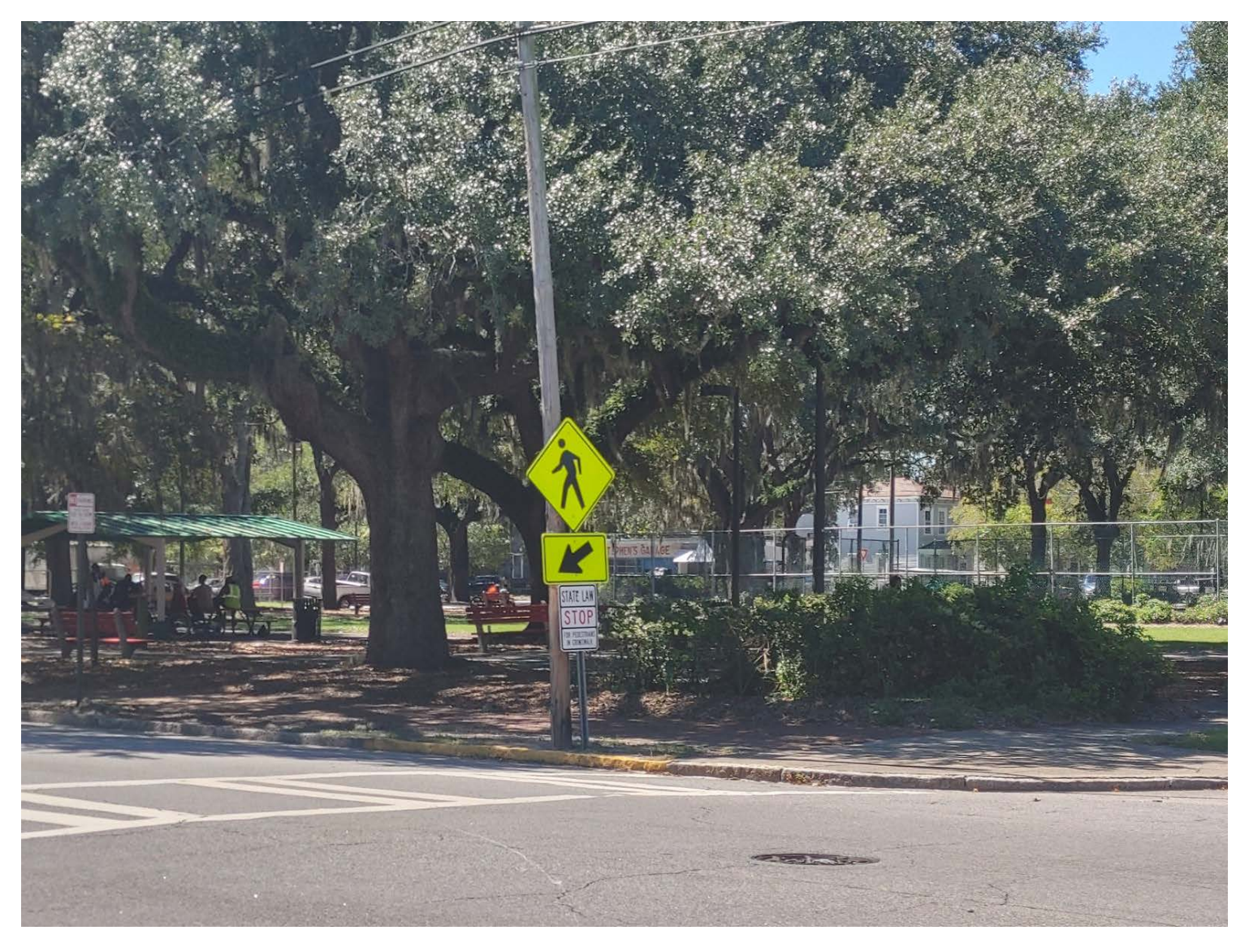
Wells Park is located diagonally to the subject property