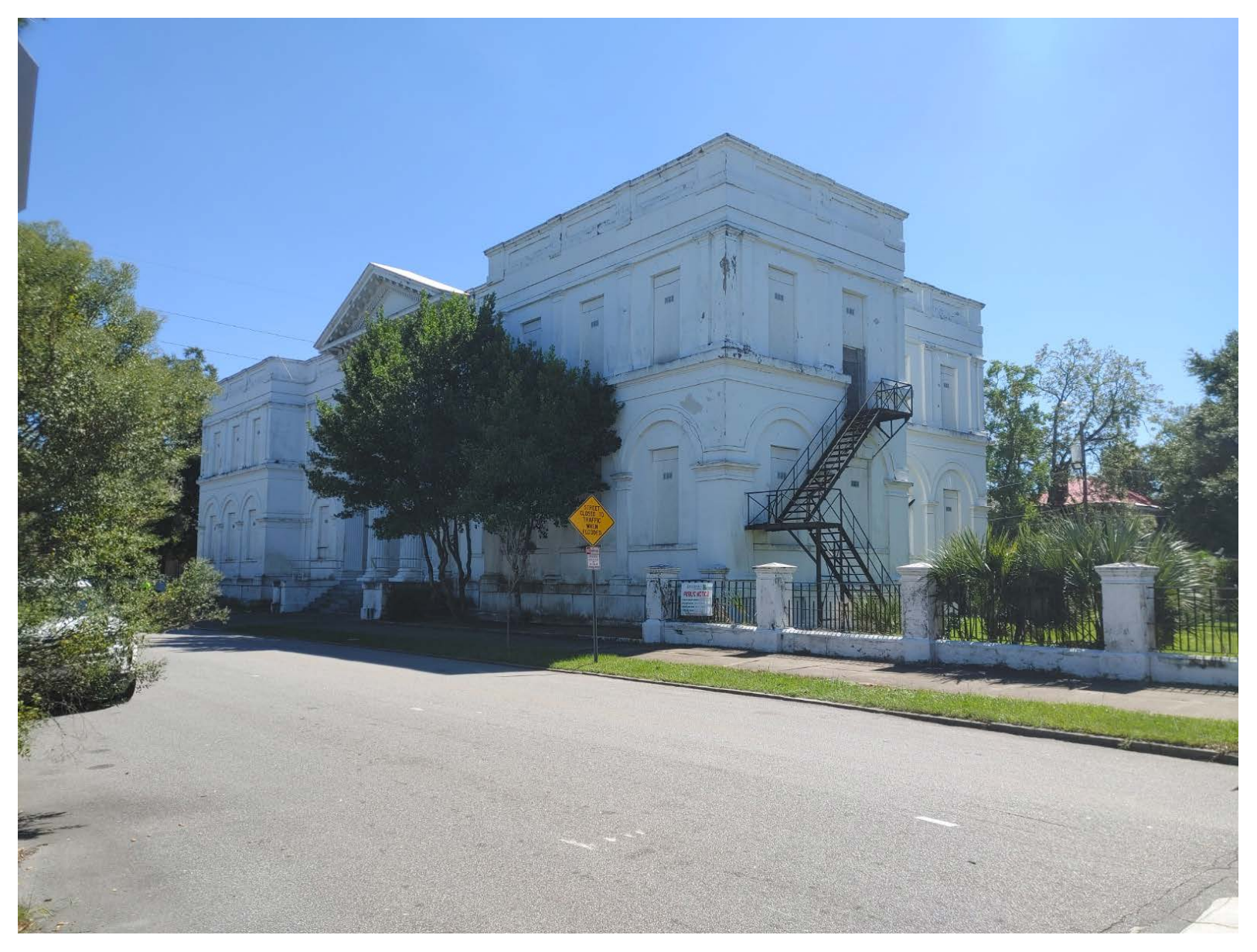
Across from the subject property on W 38<sup>th</sup> Street