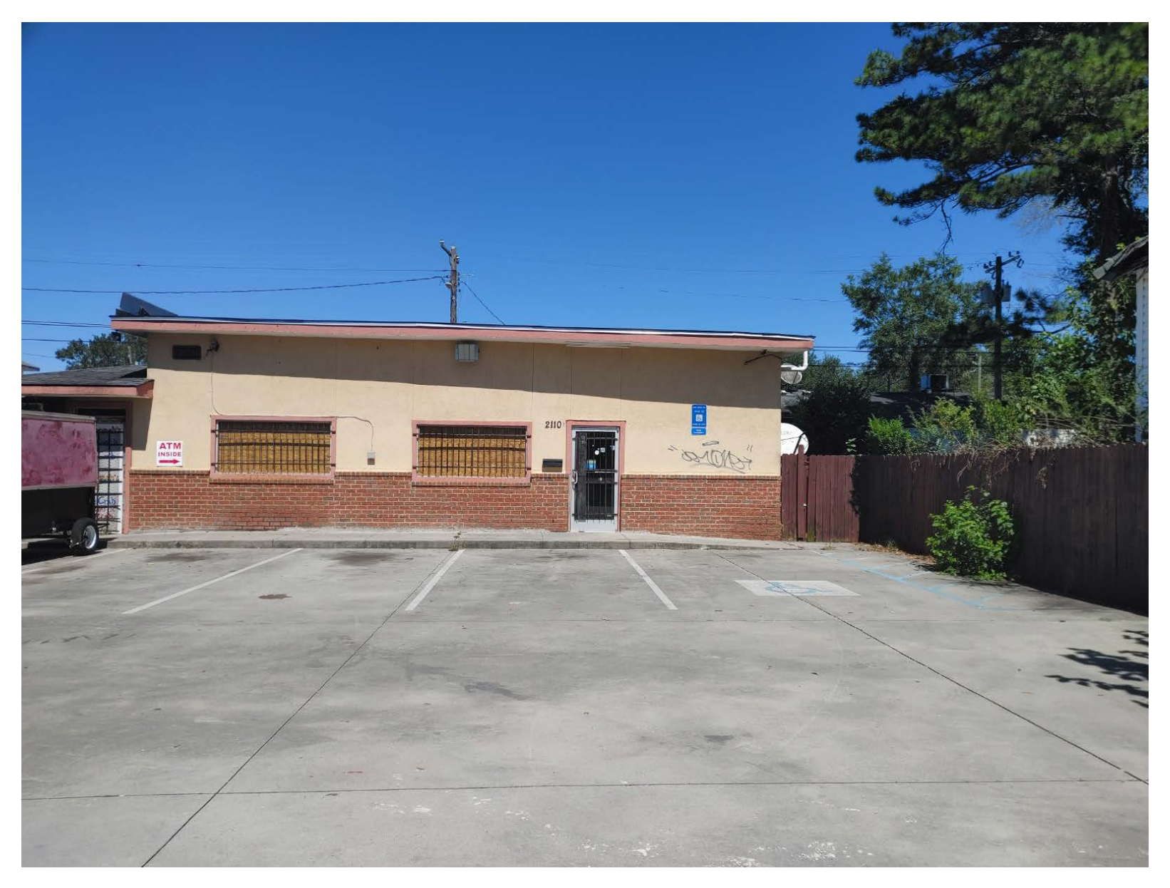
2110 Montgomery Street, Suite A