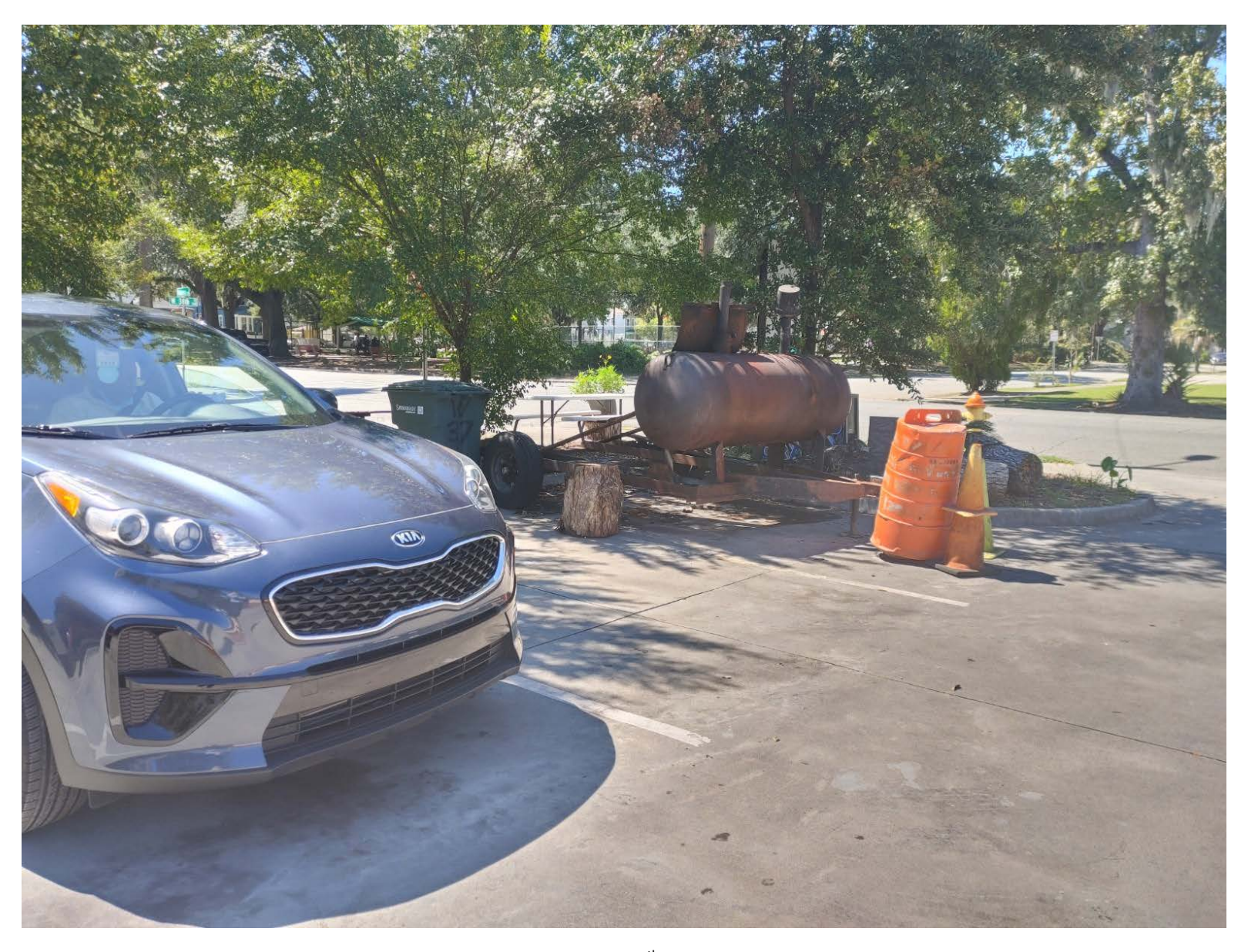
Corner of Montgomery and W 38<sup>th</sup> Street on subject property