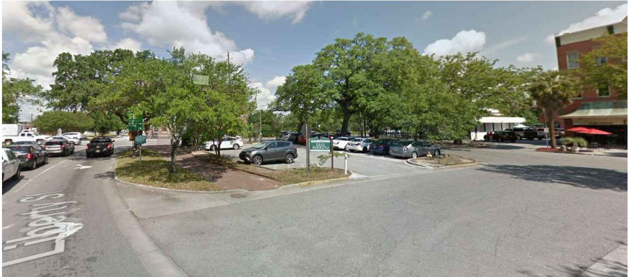
Street View of Parking Lot at Martin Luther King, Jr. Blvd. and Liberty Street