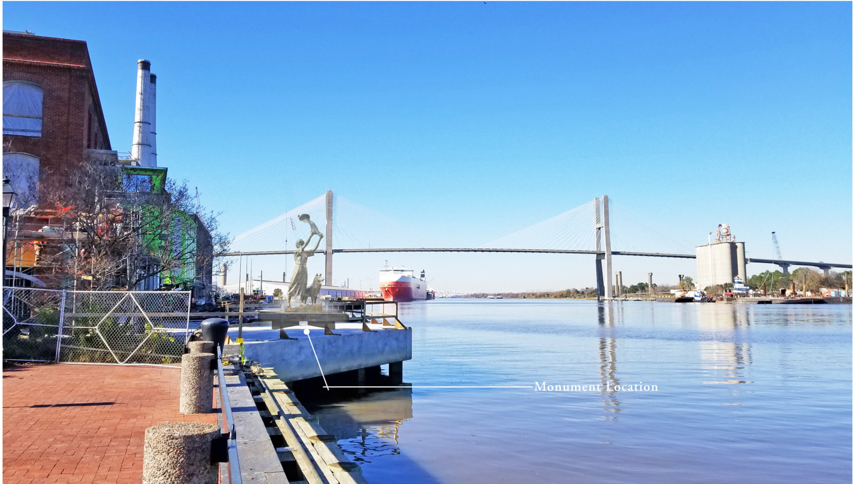
View west from monument location at the transition from the existing River Walk.