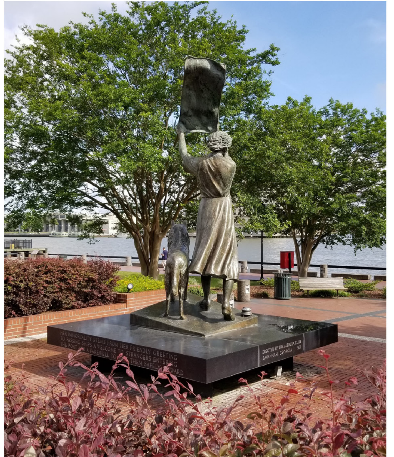
Savannah's Waving Girl Monument; Proposed Relocation