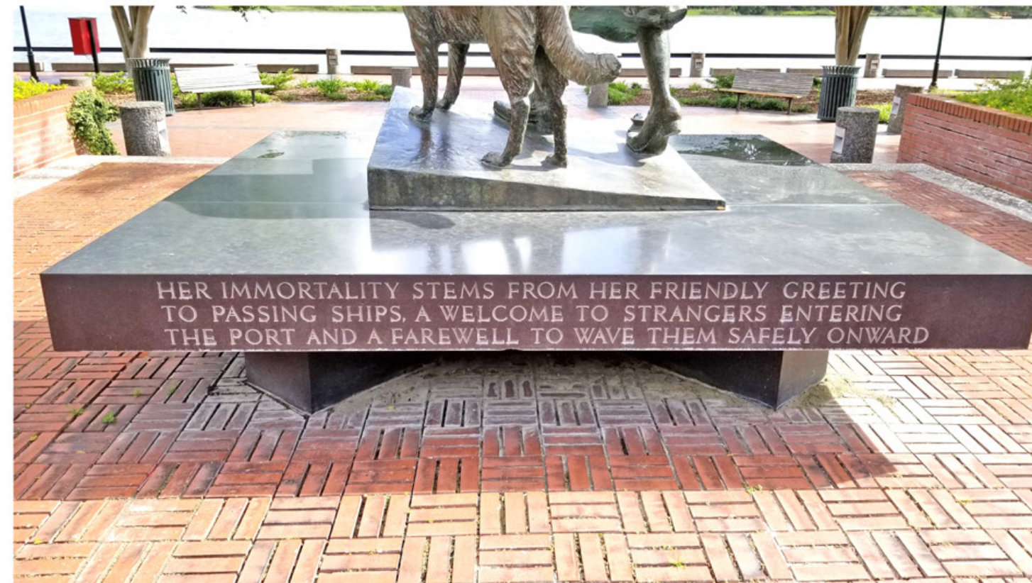
SOUTH SIDE (REAR)