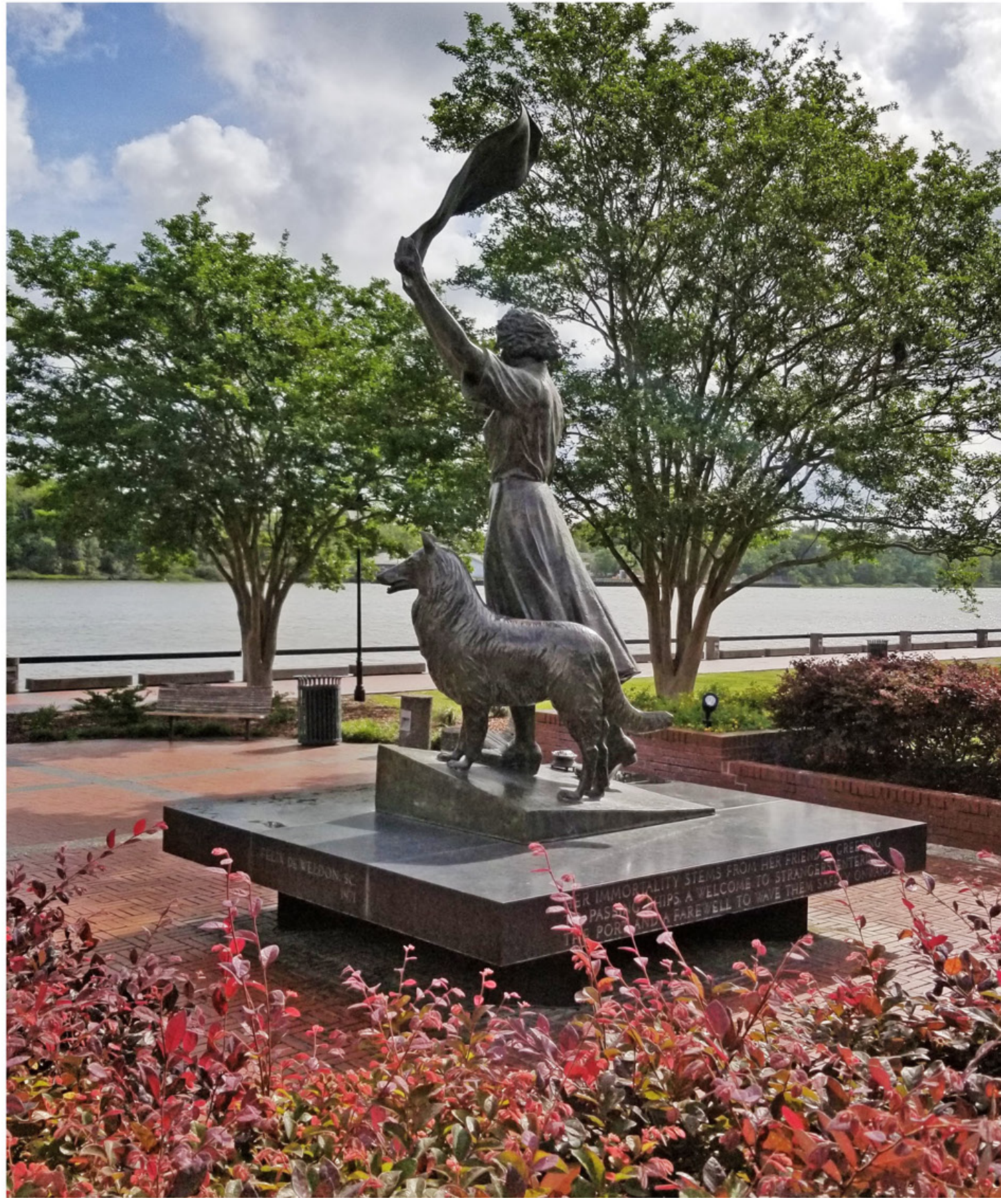
Sottile & Sottile, 2018