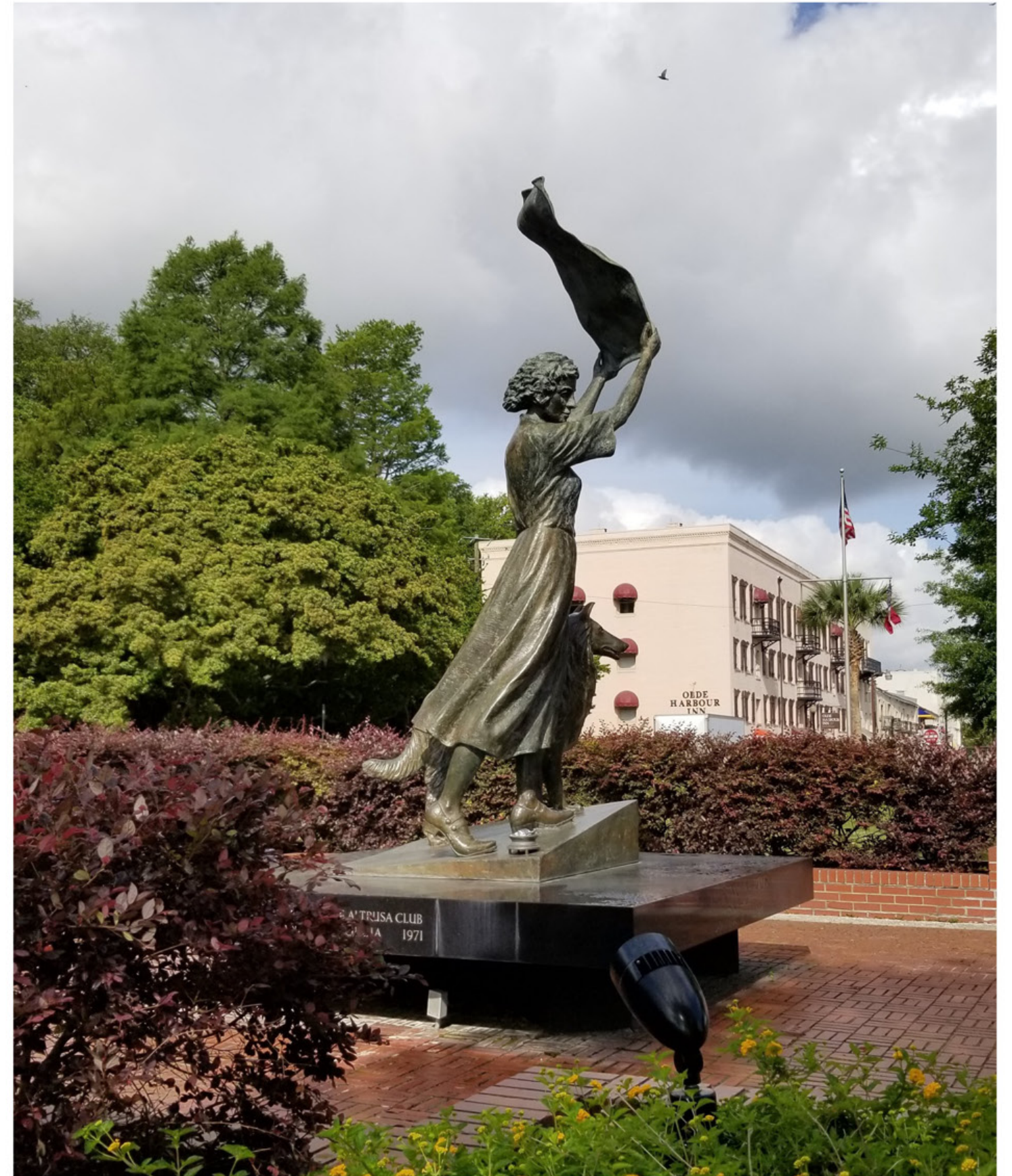
Savannah's Waving Girl Monument; Proposed Relocation