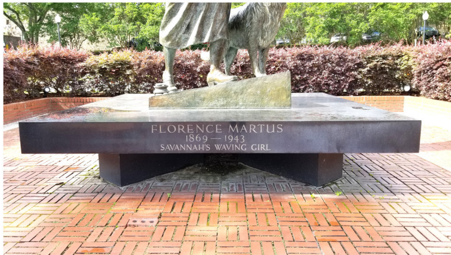
NORTH SIDE (FRONT)