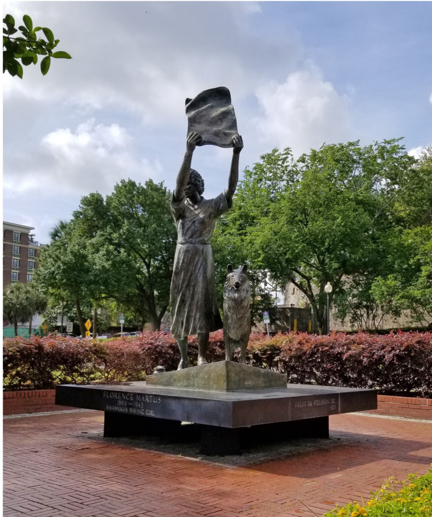
Sottile & Sottile, 2018