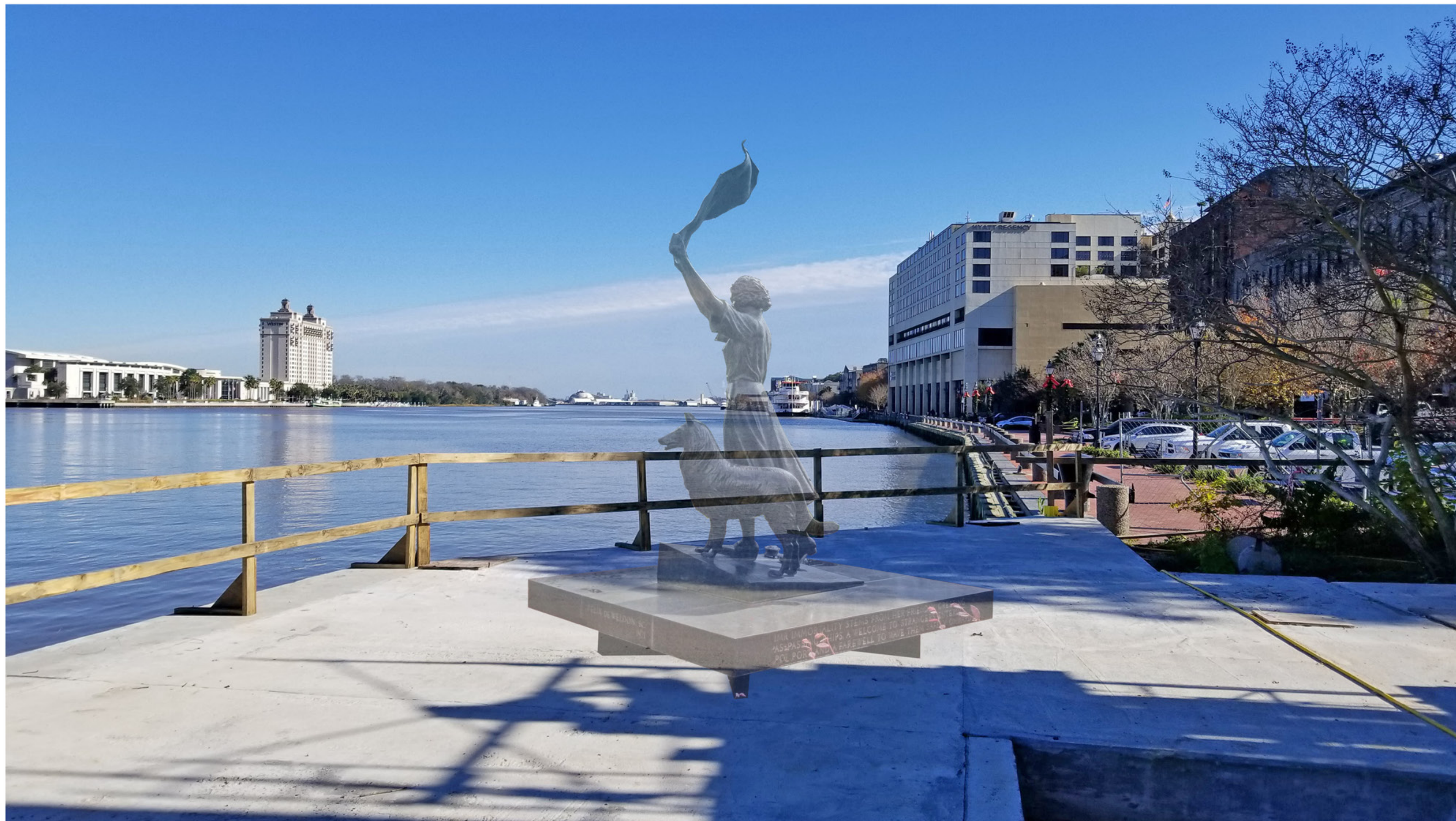
View east from monument location at the transition from the existing River Walk.