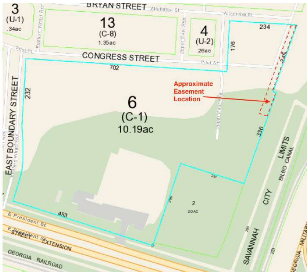
PIN 2006 05006 – Relocatable Utility Easements