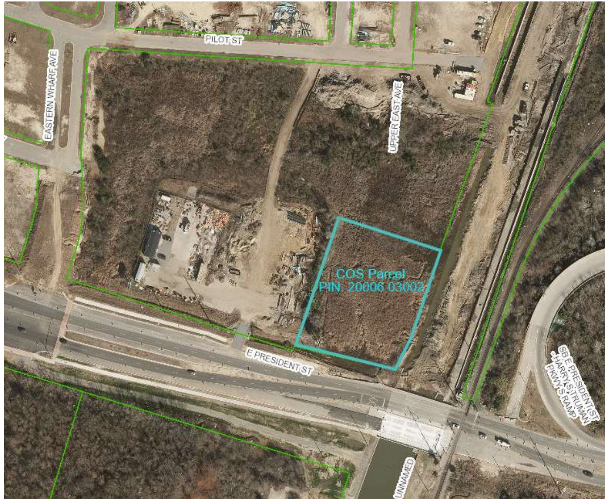
PIN 2006 03002 – President Street