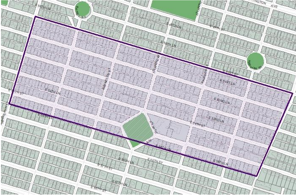
Map 2: Ardmore Conservation District (CD-2)