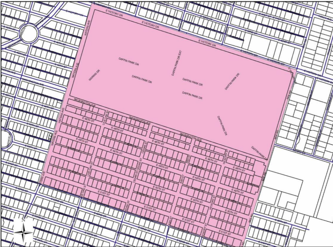
Map 3: Daffin Park-Parkside Conservation District (CD-3)