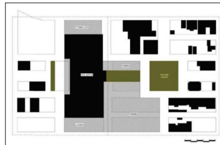
Existing Civic Center block