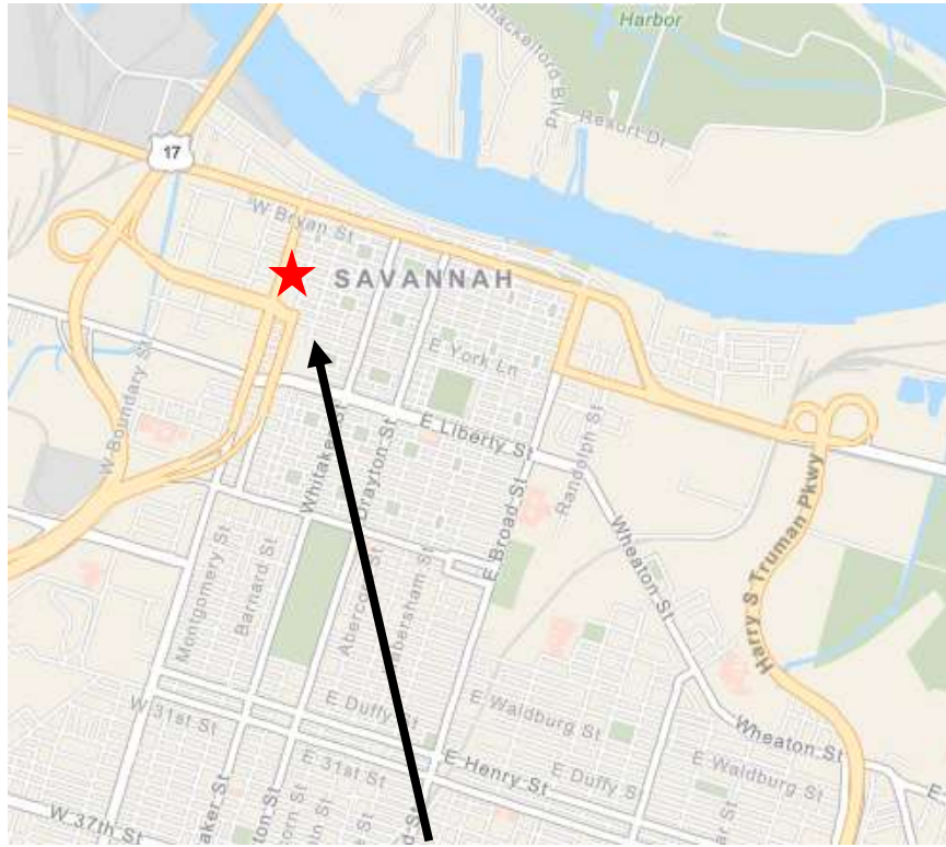
Location of subject area