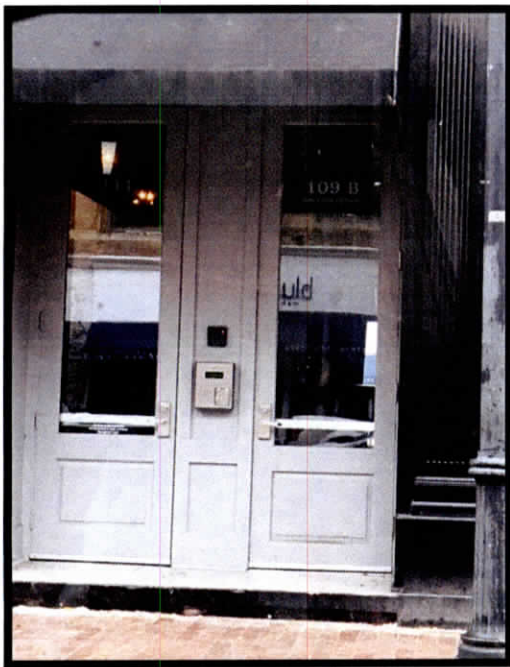
Front on Broughton