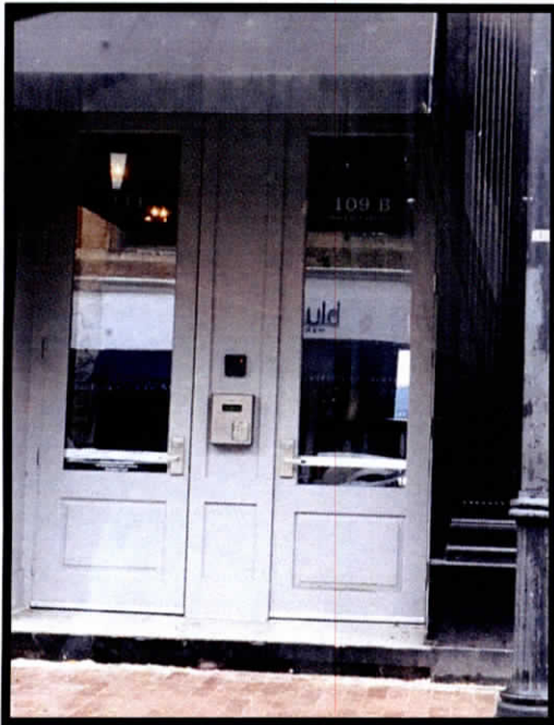
Front on Broughton