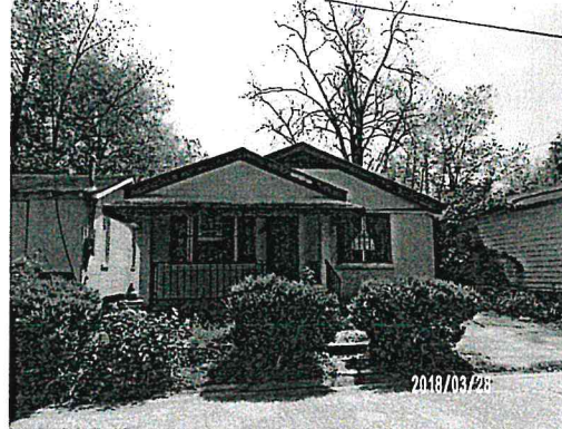
[Click for larger picture]