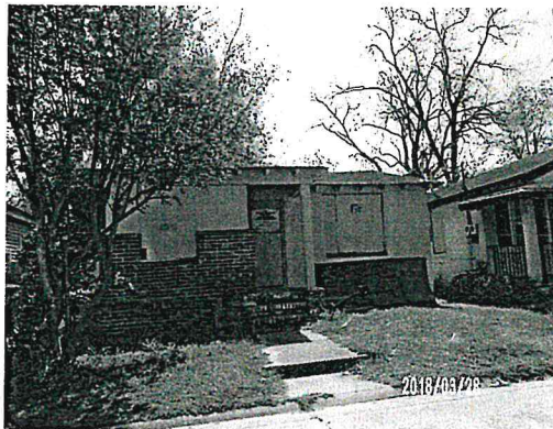
[Click for larger picture]